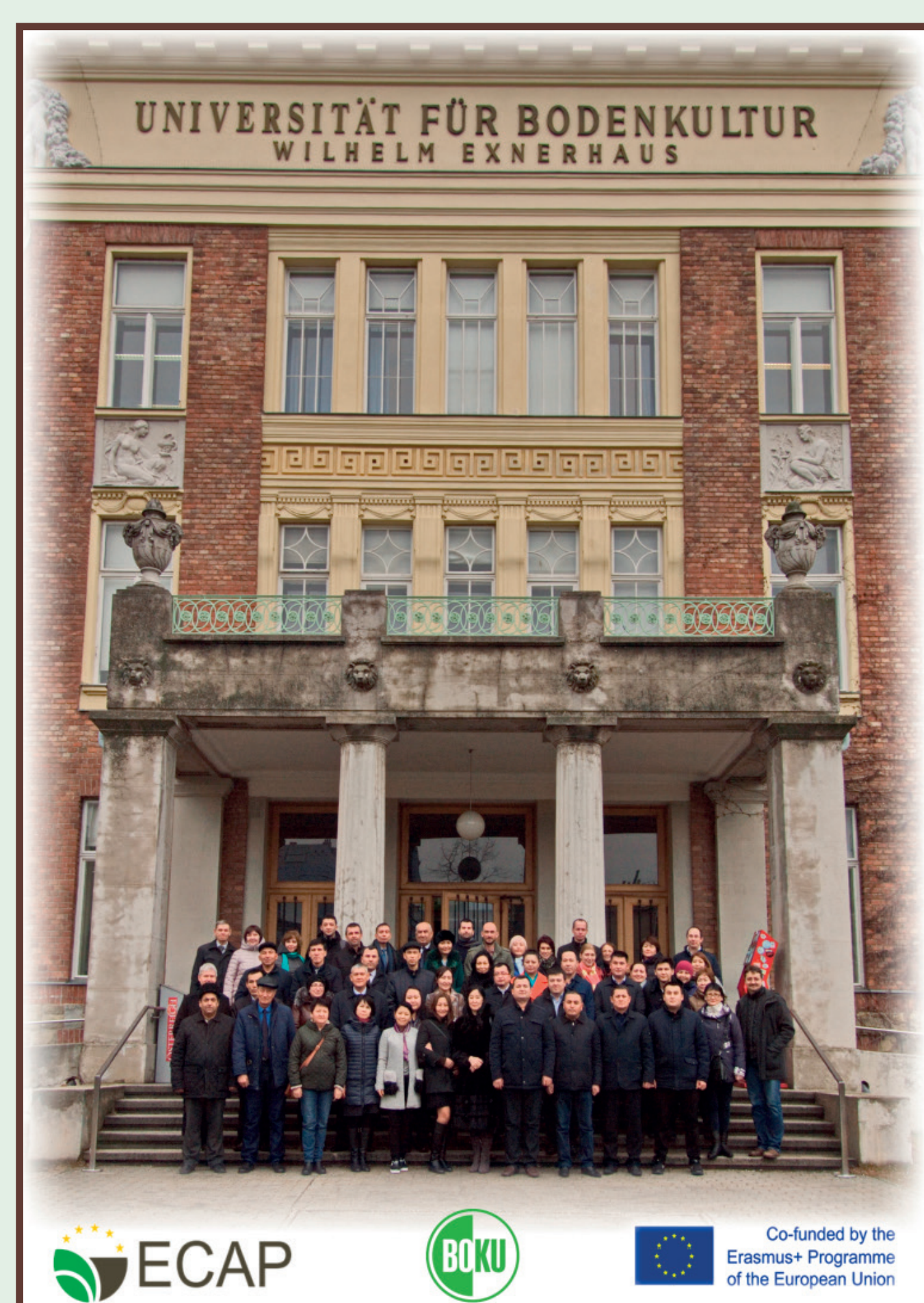
Partner meeting and training at BOKU Vienna

ECAP is an Erasmus+ KA2 Capacity Building in Higher Education project No. 561590-EPP-I-2015-I-SK-EPPKA2-CBHE-JP implemented in the consortium with partners from Slovakia, Austria, Czech Republic, Kazakhstan and Uzbekistan. The project deals with reinforcing capacities of Central Asian universities in the field of environmental protection and management.